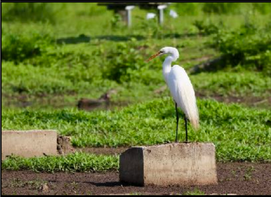
An Egret on one of the Dance Hall footers on the Lake.