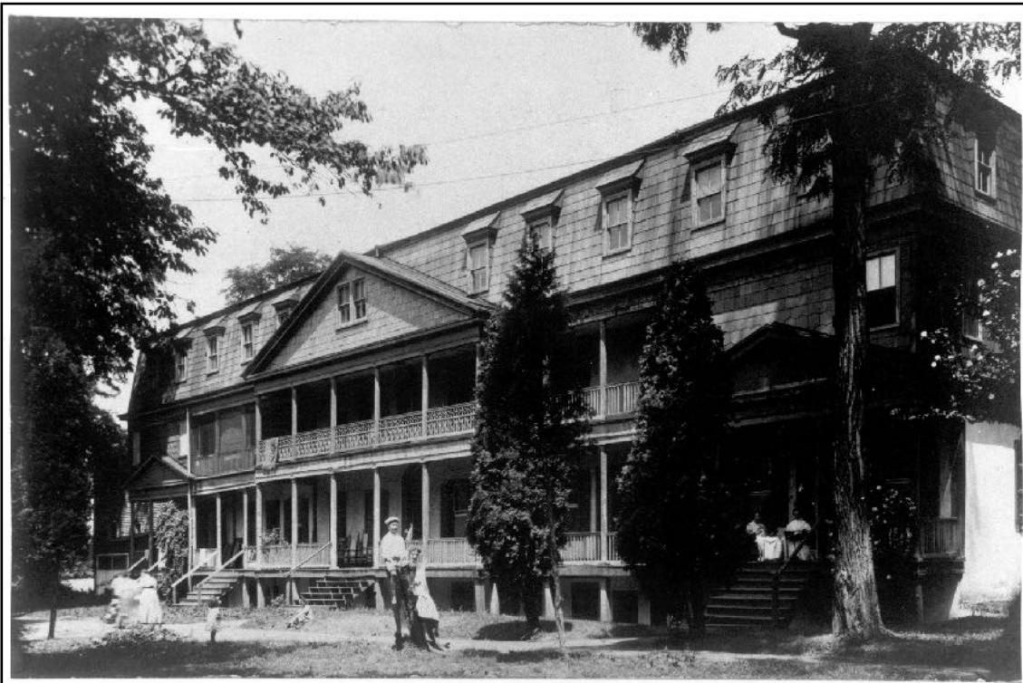
Photo of the Second Hotel - C. 1910