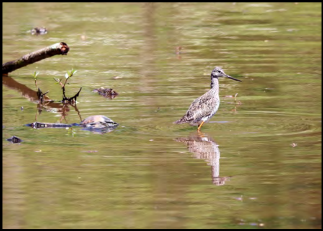
A Greater Yellowlegs studies his reflection in Lake Washington...