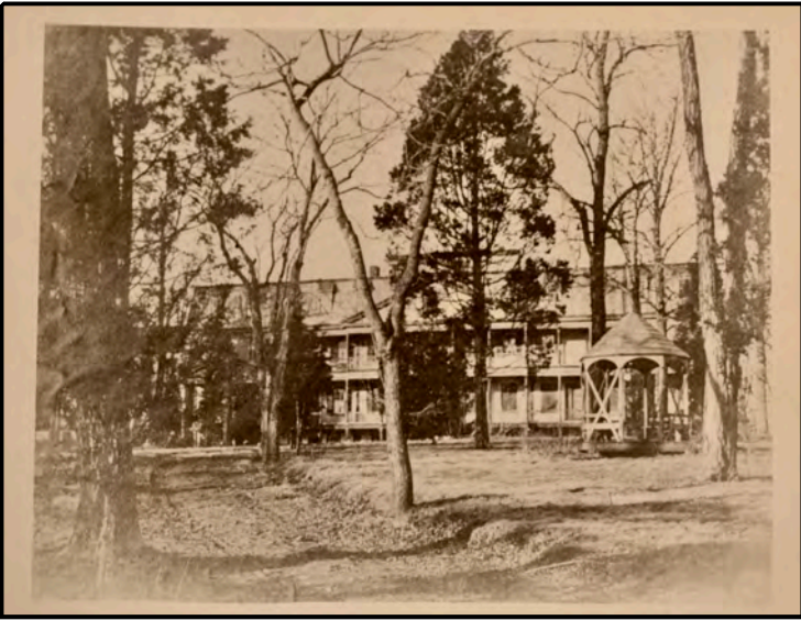
New view of the second hotel that shows the dirt lane along the front. This view also shows an unidentified structure above the third floor mansard roof and many windows and doors closed. Undated photo recently acquired by Rich Gillis.